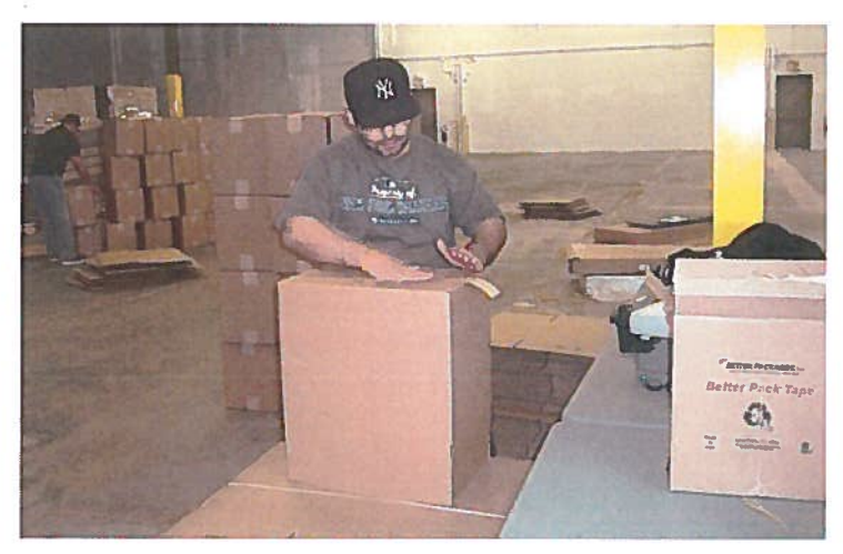
Fig. 1 Cardboard box sealing.