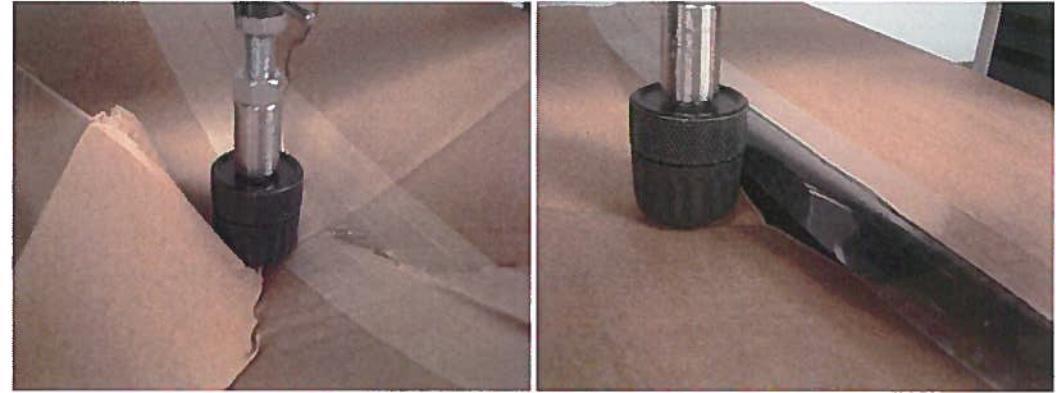
Fig. 3 Box integrity testing

Simulated severe treatment of sealed cardboard cartons with up to 5 inches flexing of top surface trying to break down the box integrity, Fig. 3.